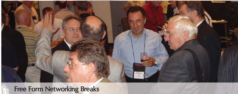
Free Form Networking Breaks