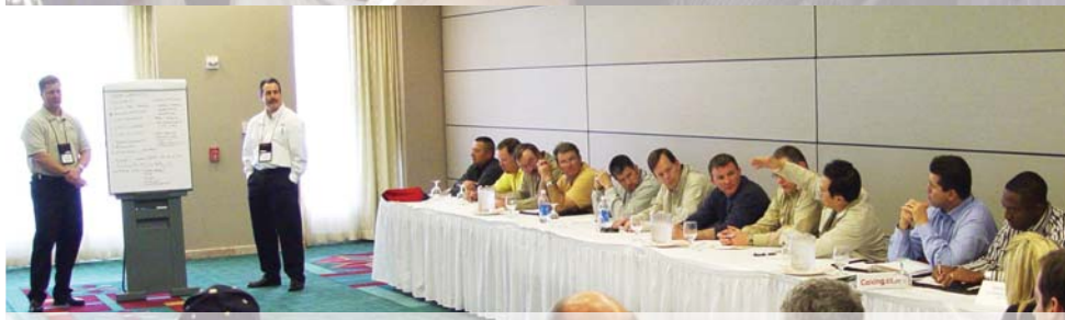
Unparalleled Breakout Sessions